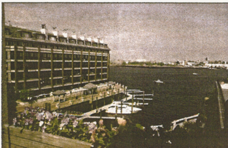
Both Townhouse 25 and Unit 505 at Union Wharf have delightful northerly views of the harbor.

There is a built-in breakfast table in front of a pass-through to the dining area. This features a mural, revealed when the pocket doors are closed; the other side is mirrored