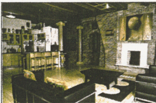
Unit 505 is loft-like, with 11-foot-high ceilings, exposed brick and bamboo flooring, but this condo also includes Italian tiles, glass and light fixtures and a state-of-the-art kitchen.

Townhouse 25 at Union Wharf, which approximates 2,290 square feet of living space, like that in Townhouse 12, has a similar floor