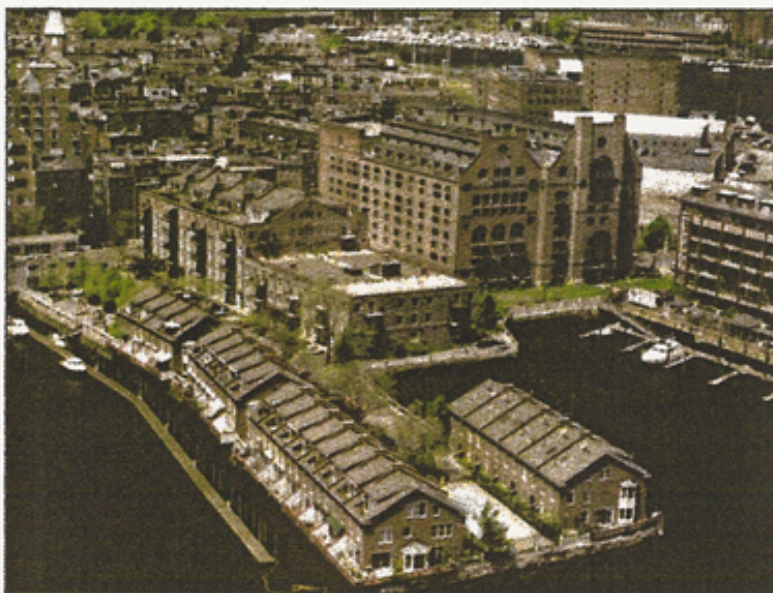
This aerial view of the waterfront shows Union Wharf, with its 23 townhouses at water's edge and the two adjacent granite warehouses, closer to Commercial Street, that were converted to condominiums in 1979. Lincoln Wharf is next to it.

"This area is like a little bit of suburbia," says Laurella as she walks toward one of the townhouses. The sidewalks are lined with shade trees, and small pine-mulched gardens