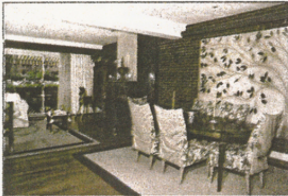
A white beamed ceiling and a mirrored wall brighten the dining area in Townhouse 12 that features exposed brick and hardwood flooring.