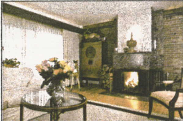
The living room in Townhouse 12 features a three-sided, wood-burning fireplace and access to a private deck.

The kitchen is open to the grand room and features top-of-the-line stainless steel appliances, including a Jenn-Air cooktop and a Frigidaire