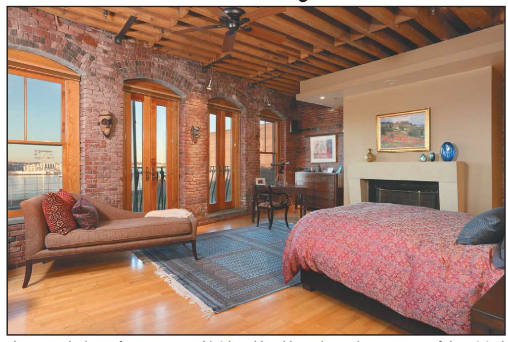
The master bedroom features exposed brick and hand-hewn beam that were part of the original building constructed at the turn of the last century.

Also on this level is an inviting media/family room, where the natural exposed brick