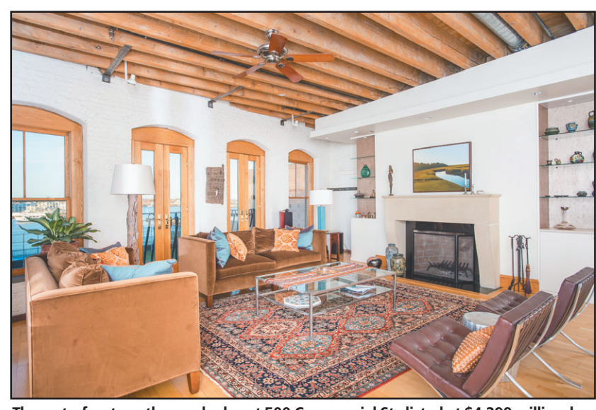
The waterfront penthouse duplex at 500 Commercial St., listed at $4.299 million, has an open floor plan and access to a balcony.