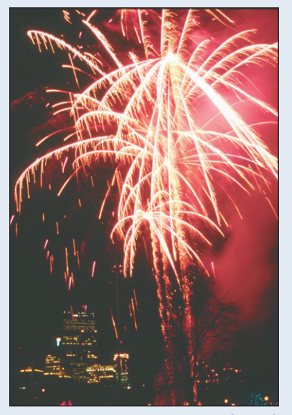
When the clock strikes 12, the first of the fireworks display will be launched in Boston Harbor.

DECEMBER 22 - 28, 2012 SERVING BEACON HILL, BACK BAY, FENWAY, SOUTH END, JAMAICA PLAIN, CHARLESTOWN, NORTH END/WATERFRONT, DOWNTOWN, SOUTH BOSTON, DORCHESTER & EAST BOSTON